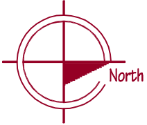
ARCHITECTURAL PLAN CM-503 FURNITURES